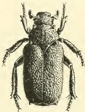
FIG. 1. Cremastochilus castaneæ Knoch. \times 4 .